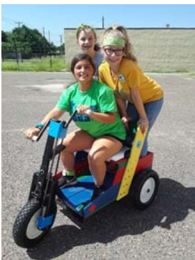
More summer Youth Mission Trip pictures

Throughout the month of August, we will have sign-up sheets at the church for different Life Groups. Current participants of our first Life Group will also be sharing testimonies during worship and be present during sign-ups to answer any questions about the joy and significance of a Life Group.