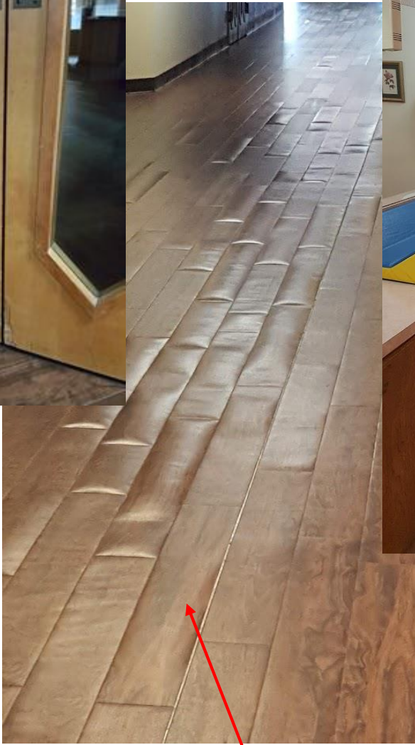
Third time's a charm ...