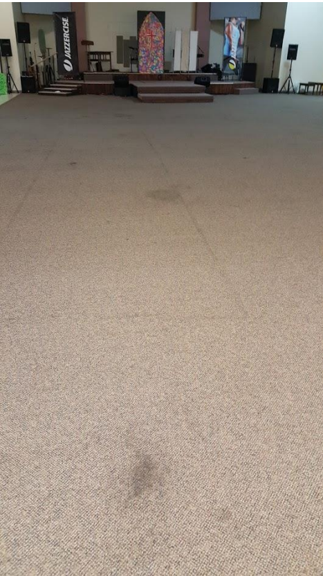
FLC Worship Area