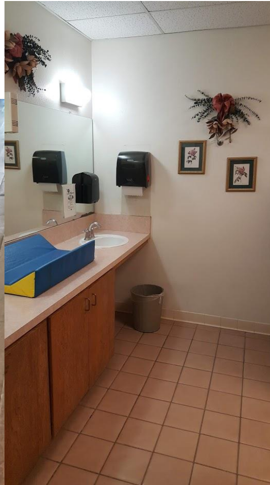
West Hall Bathroom