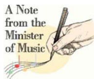
A Note from the Minister of Music